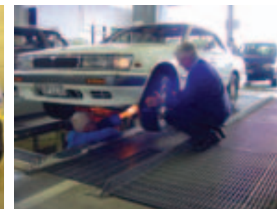
Pre-booking to reduce waiting times is being promoted by the Council.