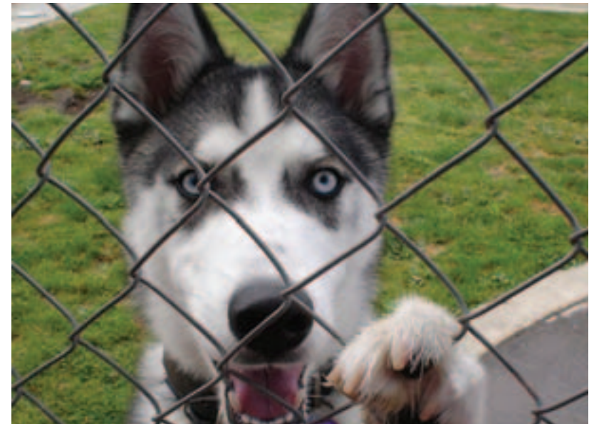
Impounded animals must generally be held for a minimum of seven days.

To offset the regulatory side of our service, work continues strongly in the field of education, welfare and re-homing initiatives. These service levels will remain largely unchanged. New legislation dealing with dog micro chipping will not impact on levels of service except perhaps for dangerous dogs, menacing dogs and new dog owners.