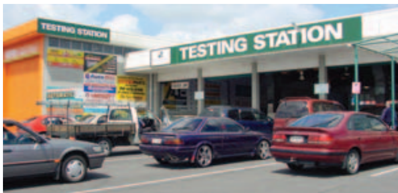
The Testing Station not only brings in revenue to the Council but also ensures safety for vehicles and drivers on the road.

Historically the Vehicle Testing Station was established to provide an unbiased warrant of fitness service as at the time there were no independent operators available in the area. Since then, Vehicle Testing New Zealand Limited (VTNZ) and On Road have established businesses in the Henderson area.