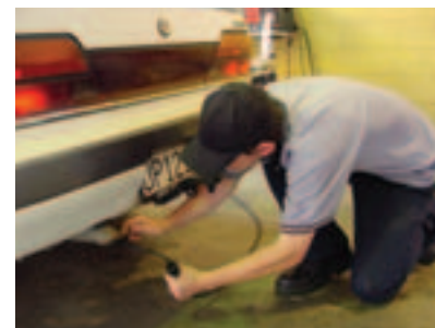
To help meet the Council's eco city vision the Testing Station currently provides free vehicle emissions testing.

Emission testing is funded from rates as this is considered to benefit the community at large by encouraging the reduction of vehicle emissions.