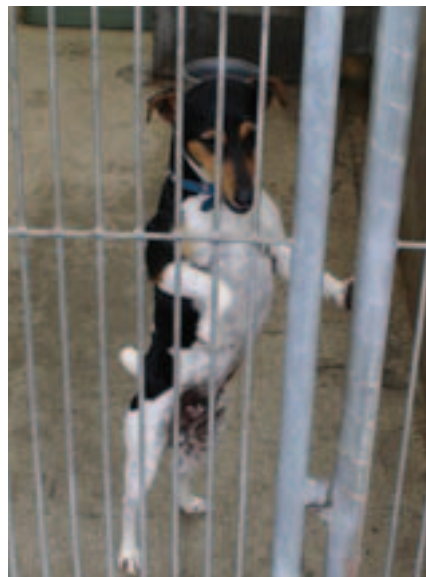
Where possible animals are re-homed.

Accommodation must be provided for dogs that have been seized or impounded. Accommodation is also provided for animals brought to and left at the facility. Kennels are provided and daily care is carried out.