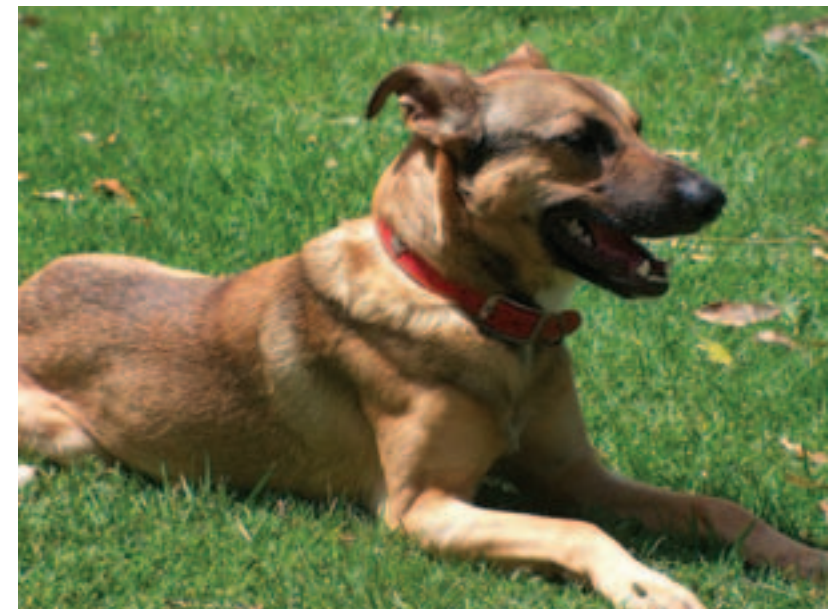
Good care and re-homing have brought this dog back to peak condition.

New capital expenditure is funded from loan as this is considered to benefit both the current and future community.